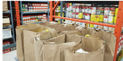
Victoria donated funds to the Food Bank Society of Whitehorse