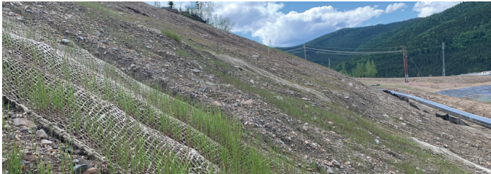
/ Control Pond jute fibre and seed growth in 2020