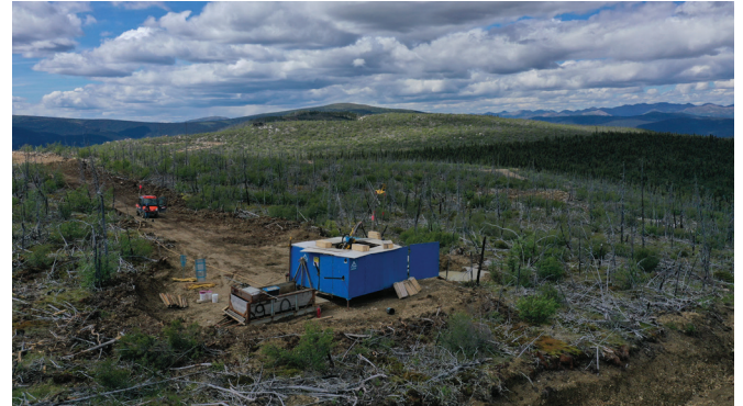
/ Exploration Drilling at Raven – July, 2020

2019 was a momentous year for Victoria and the Eagle Gold Mine as the company advanced the mine to operations over the summer and executed its first gold pour and this achievement was bolstered by the exploration success at Raven. Victoria's exploration team looks forward to another busy and production season in 2020.