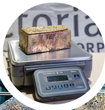
/ Inset photo: First pour gold doré bar- 1001 oz worth approximately $2 million.