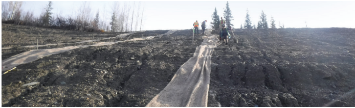
/ Control Pond jute fibre installation and seeding 2019